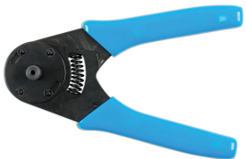
4 Way Indent Crimping Tool | 7533