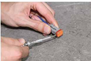
Terminal & Connector Tool Set 5pc | 7807